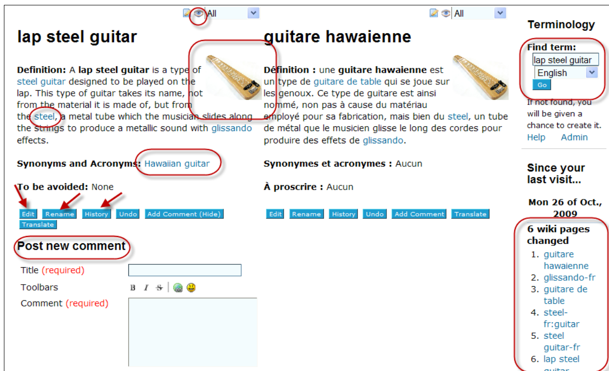
Figure 1: Viewing term and its equivalent side by side.

Tiki-CMT supports self-registration by users, but they must supply an email address which is then validated by the system. Captcha images are